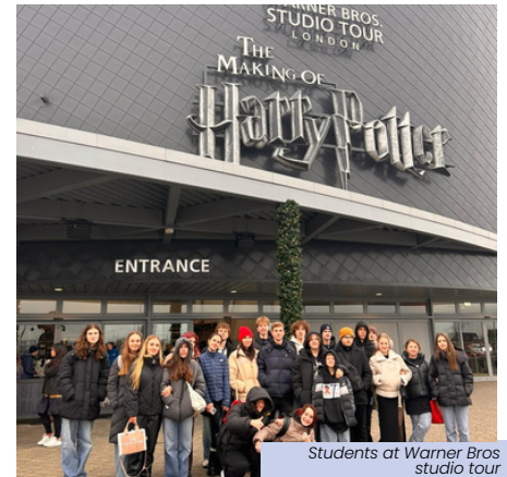
Students at Warner Bros studio tour