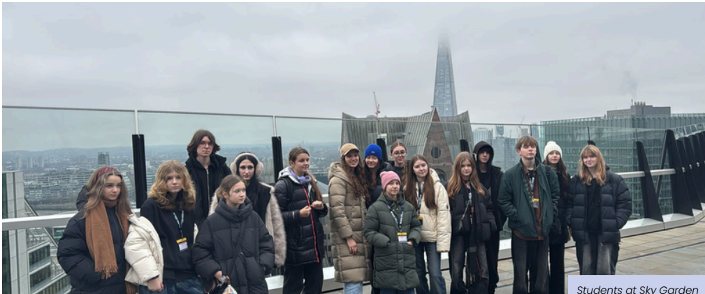
Students at Sky Garden

Pharmacy: Boots Chemist, Jubilee Place, 45 Bank St, London E14 5NY