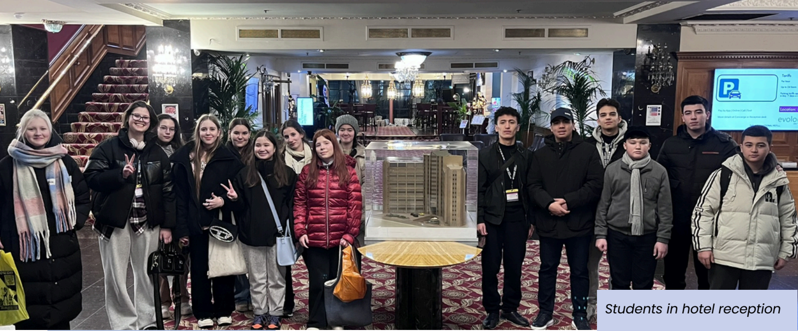
Students in hotel reception