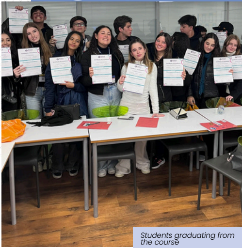
Students graduating from the course