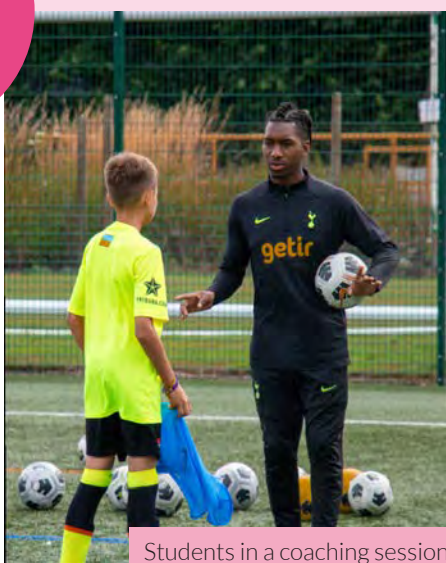
Students in a coaching session

or visit: oxfordinternationaljuniors.com/centres/english-and-football-with-tottenham-hotspur-royal-holloway