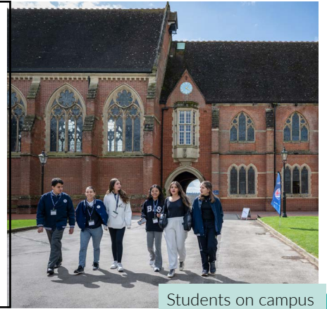
Students on campus