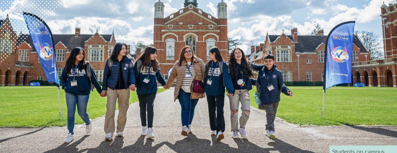
Students on campus