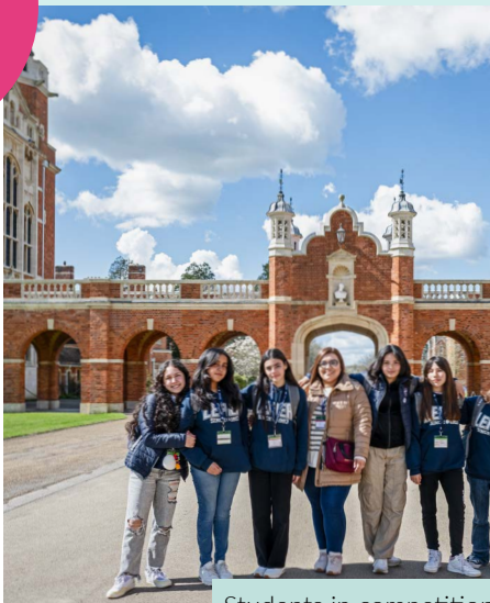
Students in competition

Dinner: A hot dinner with a vegetarian option, salad bar and dessert.