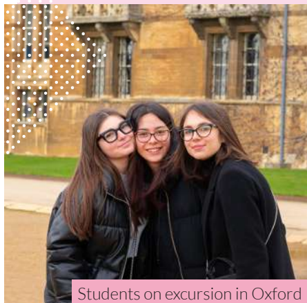
Students on excursion in Oxford