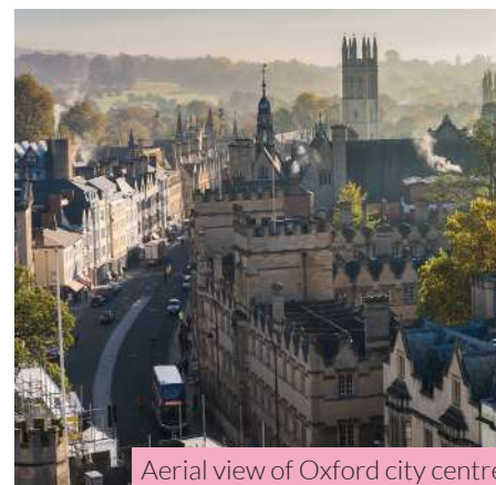
Aerial view of Oxford city centre