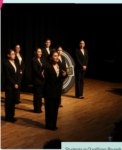
Students in Qualifying Rounds