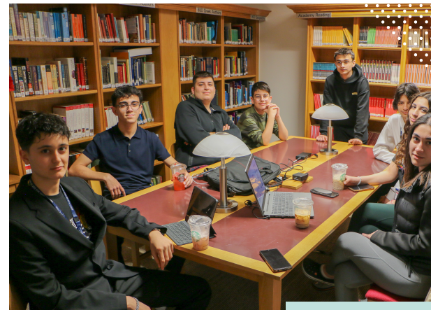
Students on campus