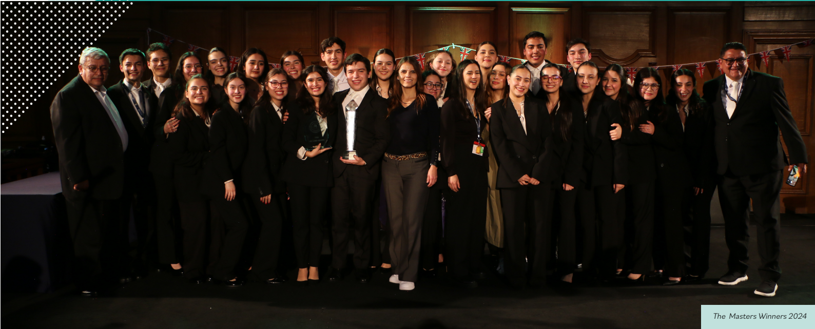
The Masters Winners 2024