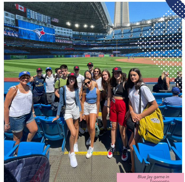
Blue Jay game in Toronto

For more images visit our Instagram: oiejuniors_na