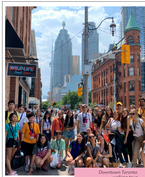
Downtown Toronto walking tour

Residences: Shared multiroom apartments with shared washrooms (1:4).