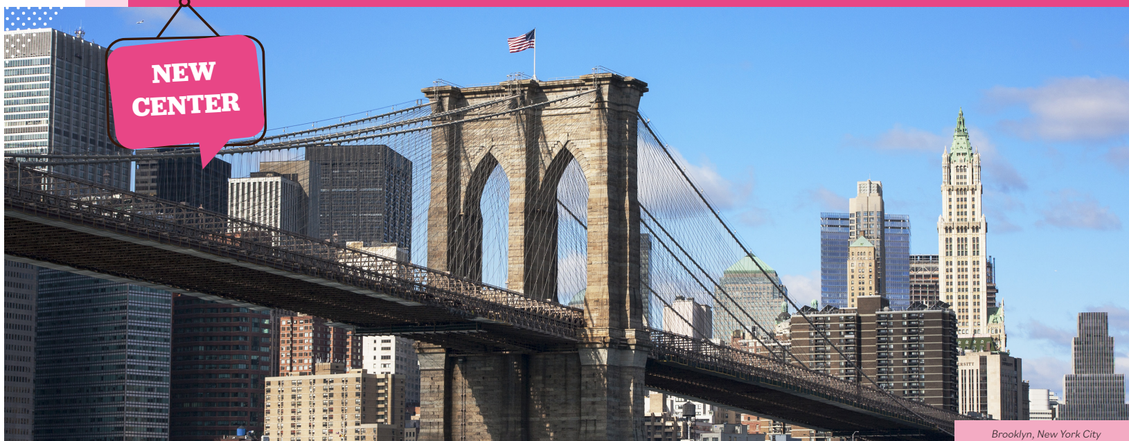
Brooklyn, New York City