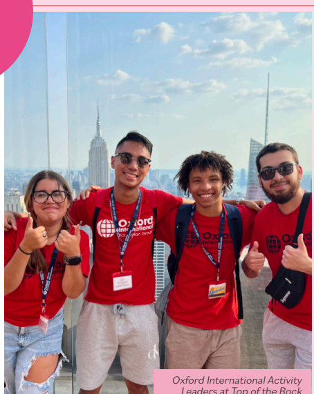
Oxford International Activity Leaders at Top of the Rock

Discover the iconic landmarks of New York City with excursions to Times Square, the Statue of Liberty, and the expansive oasis of Central Park . This is your chance to immerse yourself in the heartbeat of urban culture while making unforgettable memories.