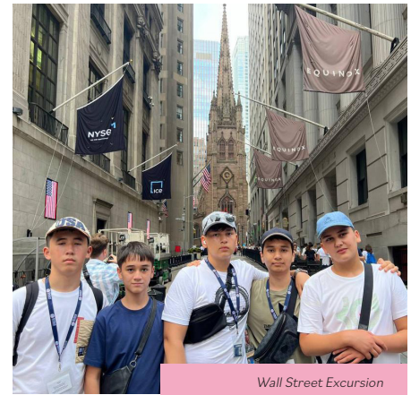
Wall Street Excursion