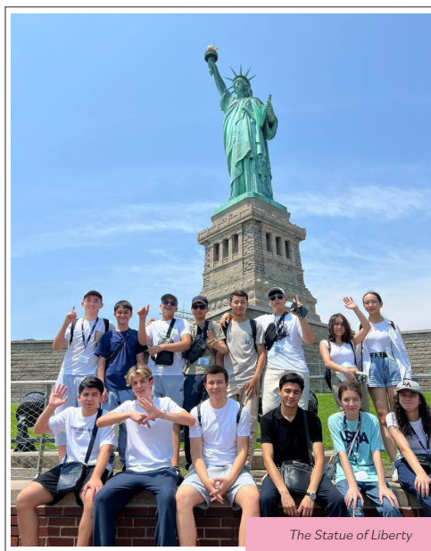
The Statue of Liberty

Residences: Single gender, 4-twin-bedroom apartments with semi-private bathroom, shared living room and kitchen.