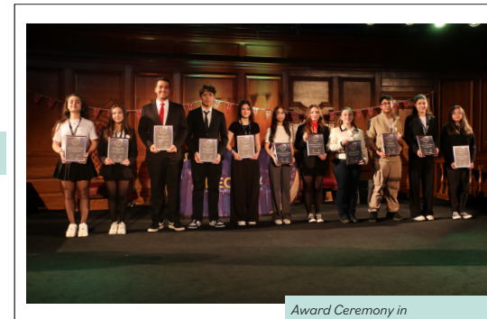
Award Ceremony in Central London

The Masters 2025 will be held at one of our prestigious Universities or boarding schools in the UK. All centres are slightly different but they all include grand venue spaces, picturesque dining halls, spacious classrooms and numerous sports facilities. Groups will find out which centre they will be competing at in February 2025.