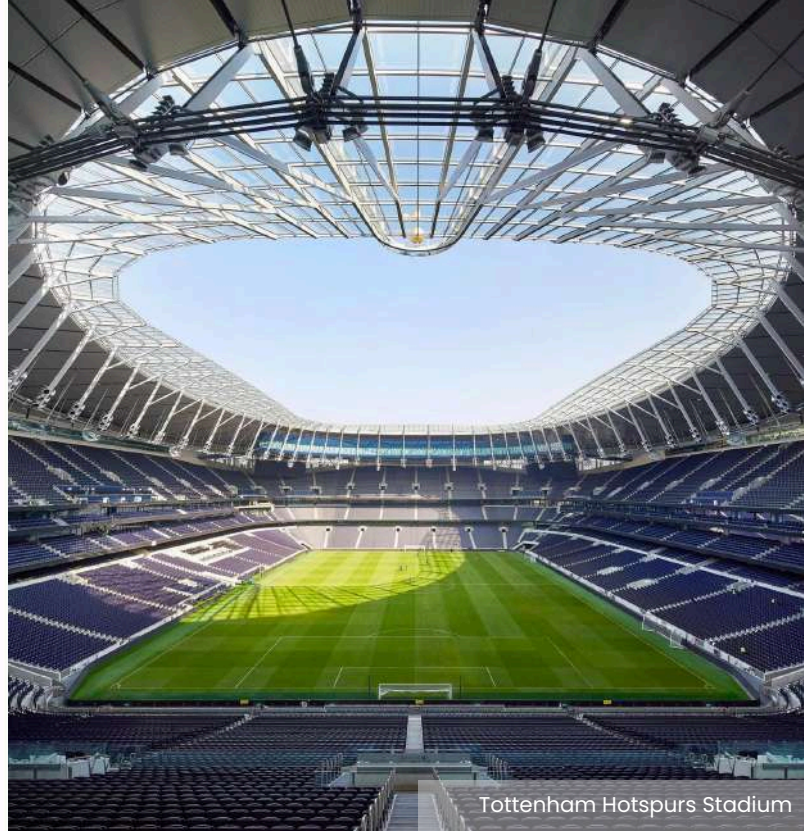
Tottenham Hotspurs Stadium

*Please note these two visits are subject to other events at the stadiums.